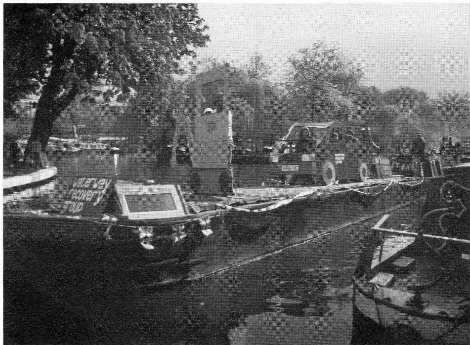
London WRG's winning entry in Canalway Cavalcade in May