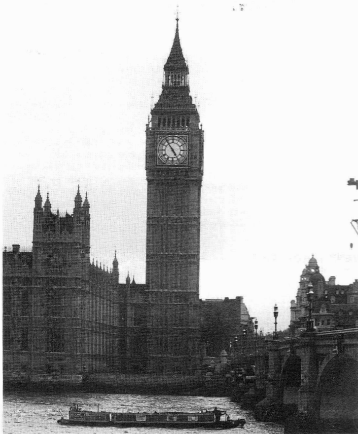
Narrowboat Spade on the Campaign Cruise past Parliament.