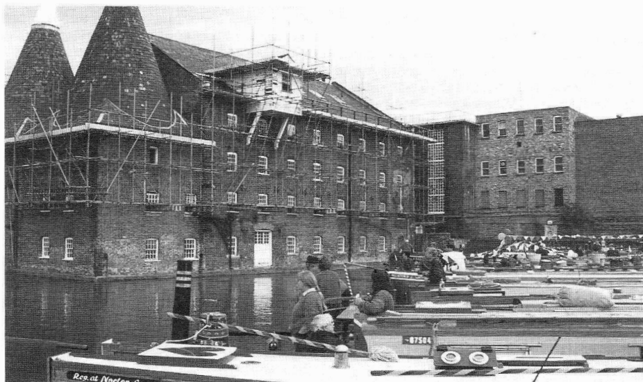
Boats rafted up across the Mill Pool at the head of Bow Creek for the opening ceremony of the Three Mills Rally in June

What's happened so far in London and what's still to come